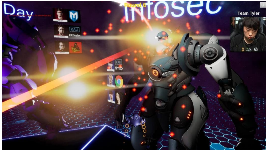
Figure 2 – Illustration of an exploit that is launched and credited to a specific player. Designation of the responsible team is indicated through the mascot, and the exploit method is visually represented by the shape and color.

Teams may also publish corrupt (or infected) patches, such that other teams must take great care. This adds an interesting dynamic to the core decision process teams face during real competitions. We also include the notion of an “infection,” in which a team has successfully penetrated an opponent’s network.