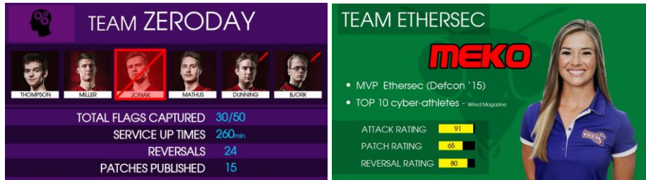
Figure 4 – Example data pages that highlight team and individual statistics.

activity (such as an out-of-bounds scan or launching external network activity from a process that is launched outside the exploit directory)